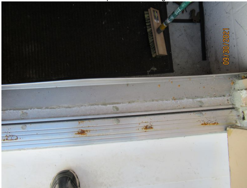
Structural: Reinforced Concrete