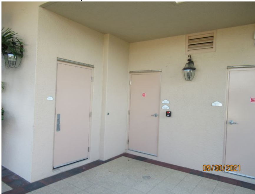
Solid Entry Doors