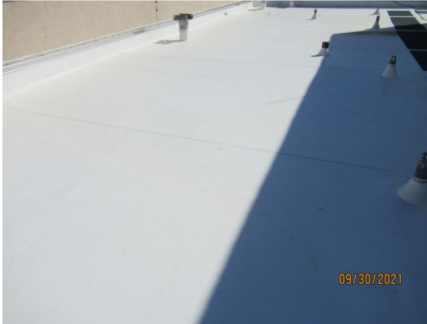
Membrane Tpo Roof Covering