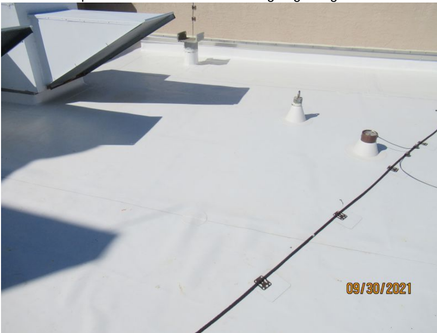
Membrane Tpo Roof Covering