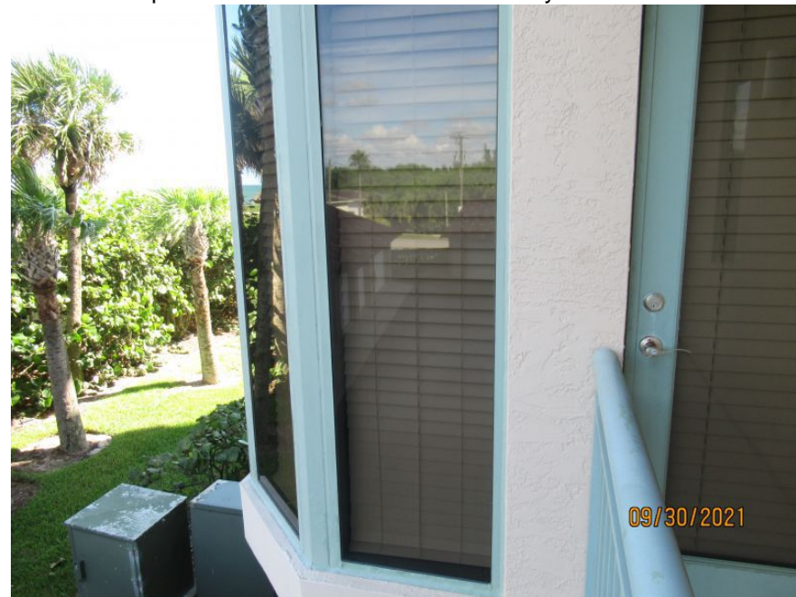
Impact Rated Window