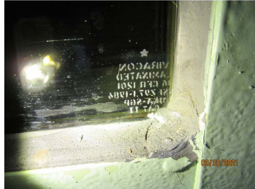
Impact Rated Glass Window Etching/engraving