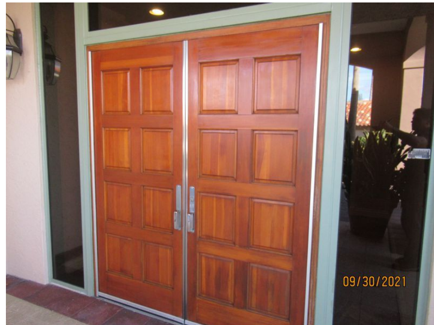
Solid Entry Doors