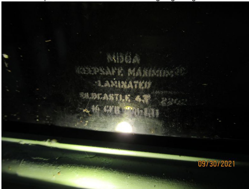
Impact Rated Glazed Door Etching/engraving