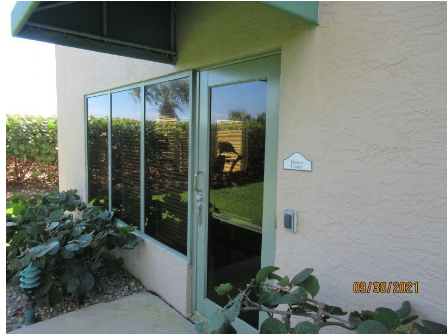
Impact Rated Window And Glazed Entry Door