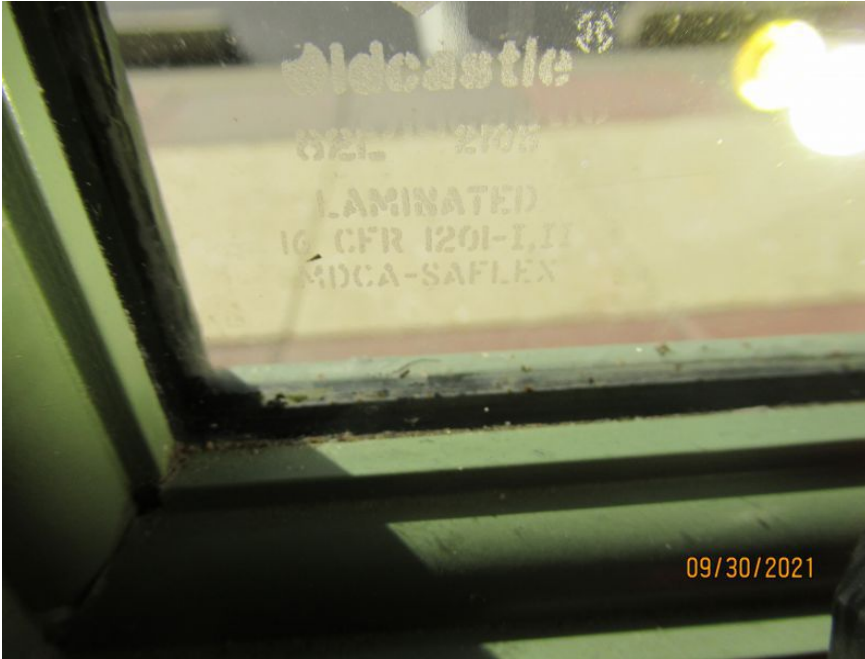
Impact Rated Glazed Door Etching/engraving