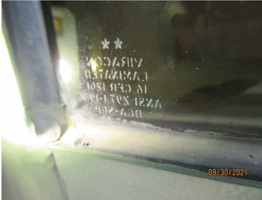
Impact Rated Glass Window Etching/engraving