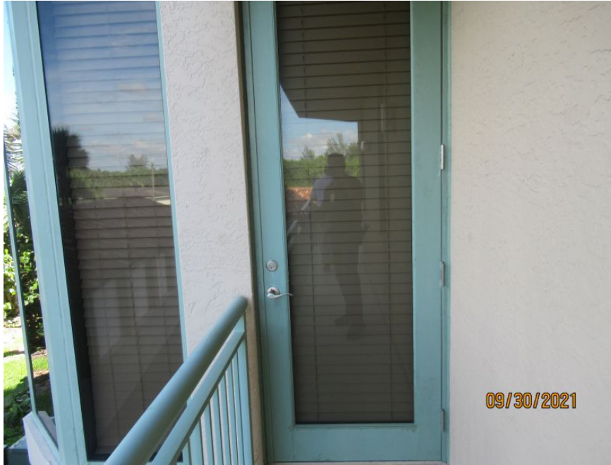
Impact Rated Glazed Door